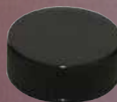
110903 Plunger Sprayer