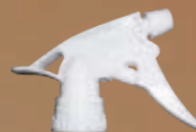
110452 Model 300 Upside Down