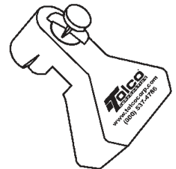
Door Buddy™ Doorstop